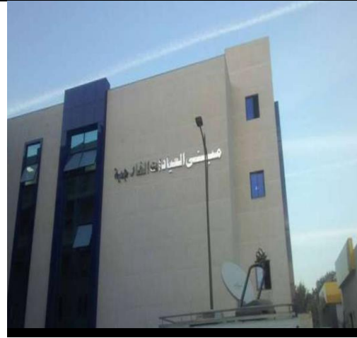
4. Building of outpatients clinics