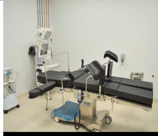
5. Oncology and Burn Hospital