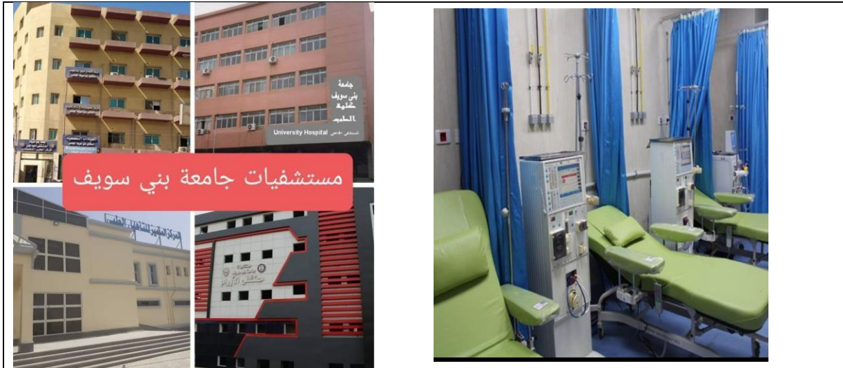
1. Beni-Suef University Hospitals

Access to physical health-care services including information and education services Health care services facilities for students, academics and administrative staffs' wellbeing