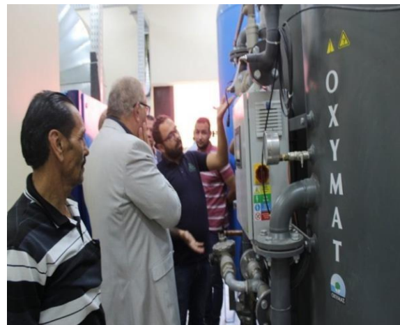
3. oxygen generating station